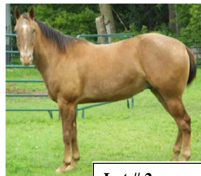
Lot # 2