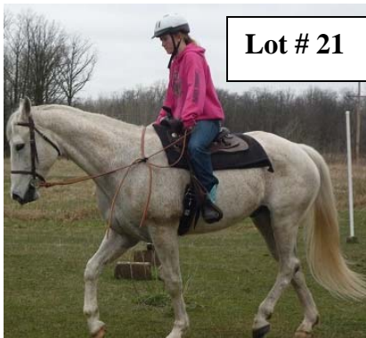
Lot # 21