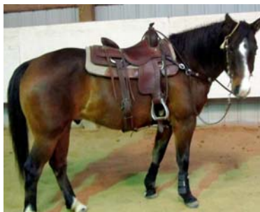
Lot # 5

Commission Rates: Catalog Sale: 8% For Un-catalog Sale: 8% with a $30.00 Minimum